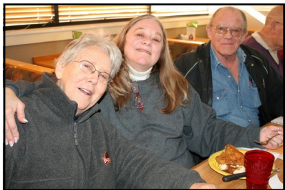
Nila ZYN, Pattie JUW Phil GFQ

Twenty-two gathered at Hometown Buffett in Tigard – all you can eat! The 2012 calendars were also distributed, hot off the press.