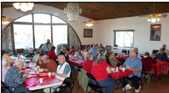
A big group!

Back to The Eldorado for the February birthdays party! Thirty-four happy and hungry Dipsea Netters attended.